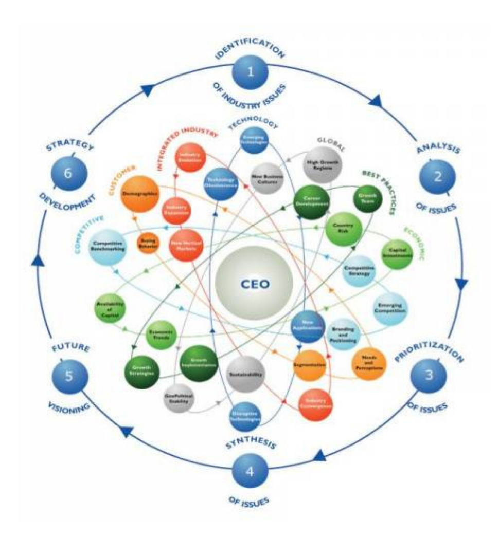
Chart 5: The CEO's 360-Degree Perspective™ Model