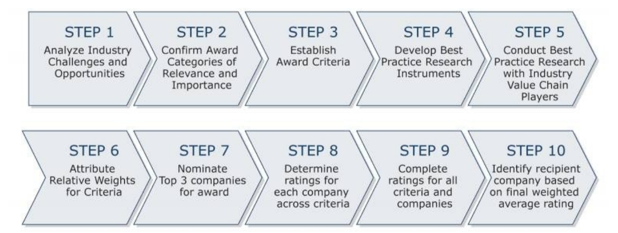
Chart 3: Frost & Sullivan's 10-Step Process for Identifying Award Recipients