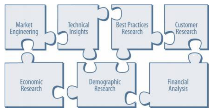
Chart 6: Benchmarking Performance with TEAM Research

Frost & Sullivan's TEAM Research methodology represents the analytical rigor of our research process. It offers a 360 degree view of industry challenges, trends, and issues by integrating all seven of Frost & Sullivan's research methodologies. Our experience has shown over the years that companies too often make important growth decisions based on a narrow understanding of their environment, leading to errors of both omission and commission. Frost & Sullivan contends that successful growth strategies are founded on a thorough understanding of market, technical, economic, financial, customer, best practices, and demographic analyses. In that vein, the letters T, E, A and M reflect our core technical, economic, applied (financial and best practices) and market analyses. The integration of these research disciplines into the TEAM Research methodology provides an evaluation platform for benchmarking industry players and for creating high-potential growth strategies for our clients.